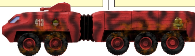
Legion 4F6 Legate Transport

Gatling Railgun Crew-served Weapon: See right