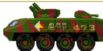
Legion 800 Centurion Heavy Mortar

Command Vehicle: 1cm Gatling railgun: Sh 3, FP 1/3 but carries 2 TU's of Infantry . Mortar Carrier: Double-barrel Heavy Mortar: Sh 2 shots, FP 5/4 No Short or Med . 1cm Gatling railgun: Sh 3, FP 1/3 . Carries 2 TUs of Inf .