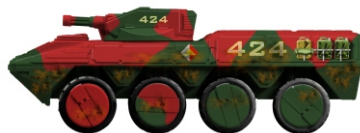
GIAT RA4-80 'Gun Truck'

Artillery variant: 15cm launcher: Sh 1, FP 5/6 QR REDUCE -1 FOR DIRECT FIRE (so fire as Trained: 5+ ); 1cm Gatling railgun support weapon: Sh 3, FP 1/3 .