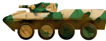
GIAT RA4-80 (8x8)