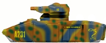
HE-T4 Caatinga (Viper) Heavy ICV