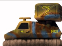
GIAT Brazilia CN44 Jeep

Mule ACV: Same stats No weapon - may carry 1 TU of Inf. who may fire coil-guns Sh 2, FP 1/3 from vehicle