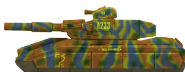
HE-T7 Surucucu Heavy Tank

M2A7F Command Tank: same stats but no coaxial 2cm Gatling weapon.